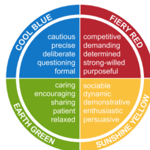
The Insights Discovery 4-Type Wheel